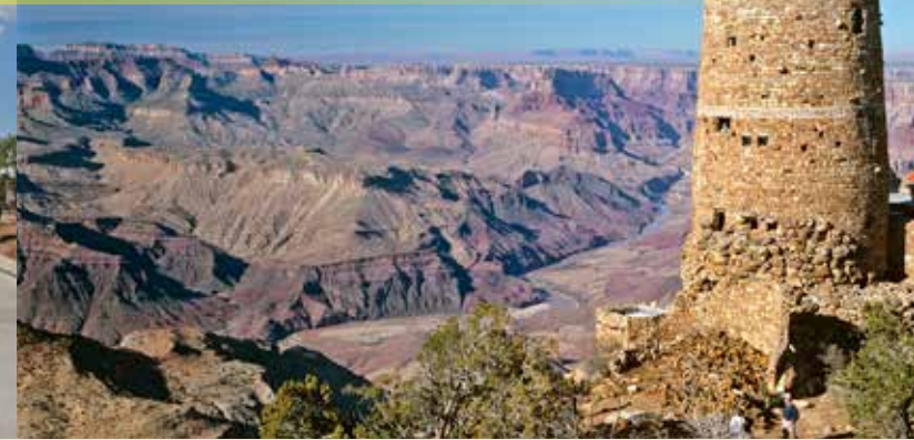
Desert View Watchtower