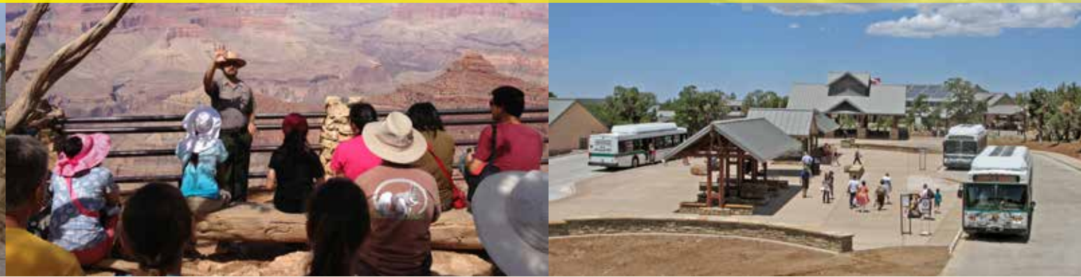
Park Ranger Program